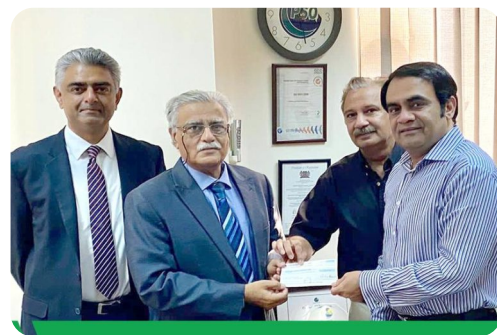
PSO has joined hands with CCH&RC by providing a donation for the procurement of machinery vital for the effective treatment of cancer patients.

Those who (in charity) spend of their goods by night and by day, in secret and in public, have their reward with their Lord: on them shall be no fear, nor shall they grieve. (13) 002.277