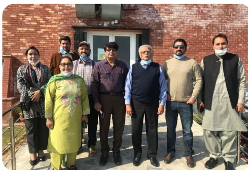
President & Secretary Finance of College Road Township Trade Association visited Cancer Care Hospital on Nov 18, 2020