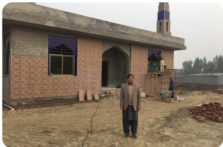
The main mosque of the hospital constructed with the generous donation of Mr. Muhammad Anwar.