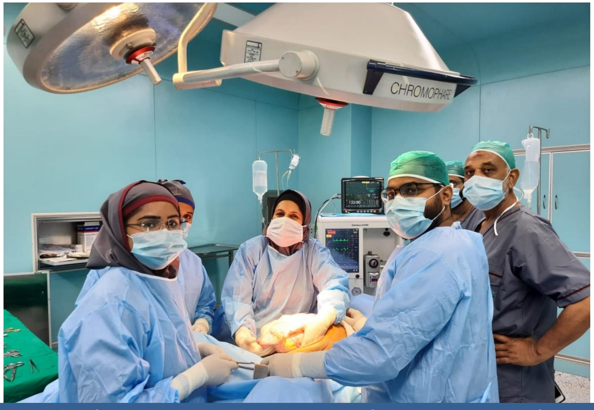
A special day for Cancer Care HospitalFirst major surgery of Sarcoma 22 KG in weight for a 70 years old patient. Alhamdulillah. Dated: 19 July, 2022